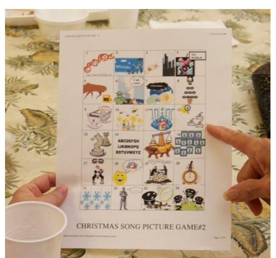
One of the games was to guess the Christmas carol depicted in the cartoon. There were 16 different ones. Winning team got 15 right.