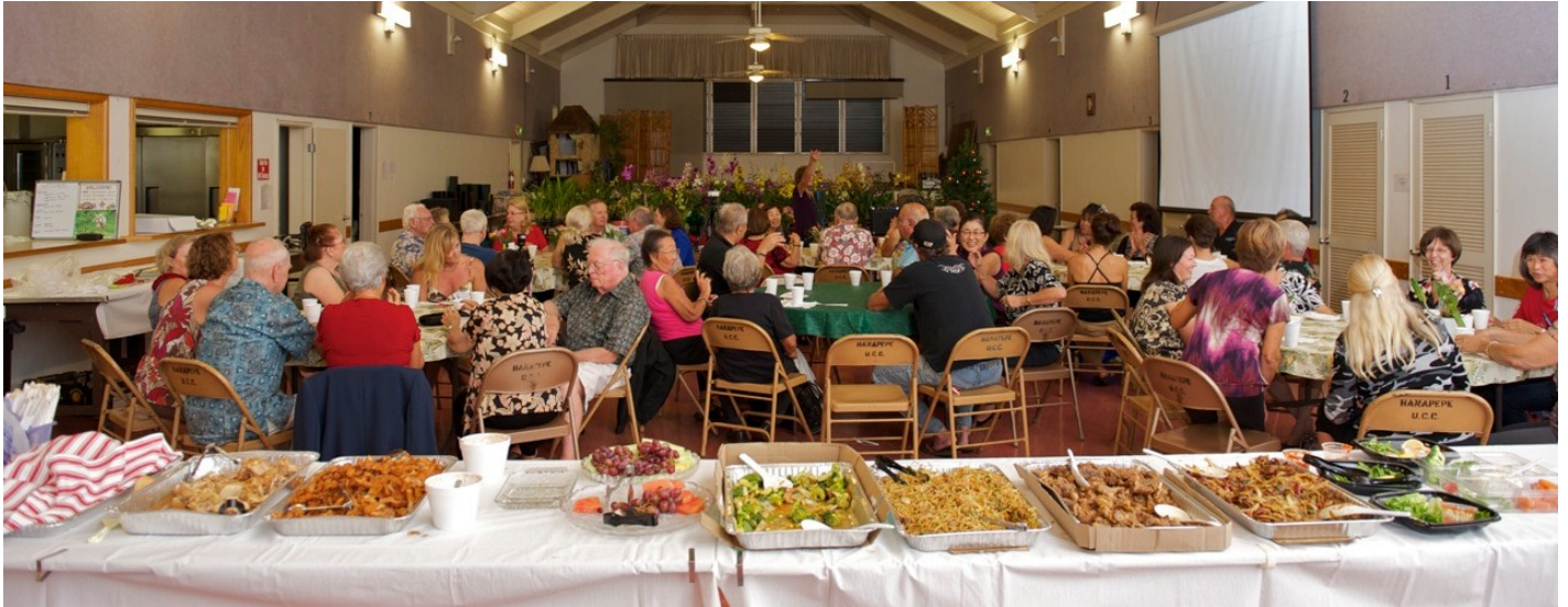
We had a great turnout for the December celebration at the United Church of Christ in Hanapepe. Food was catered by No. 1's in Kalaheo and supplemented with additional items. In the background you can see all the orchids ready for Makana redemptions and purchases.