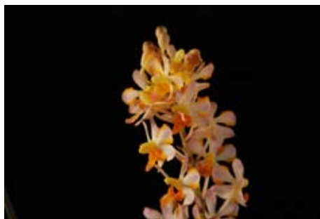
Best Misc. Vanda - Ascovandoritis Prapin – Grower Orchid Alley