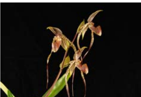
Best Paphiopedilum: Paph. Lady Booth #3' x Prince Edward of York – Grower Orchid Alley