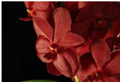
Best Vanda Alliance - Ascocenda Ascda. Fuch's Port Royal x Yip Sum Wah – Grower Orchid Alley