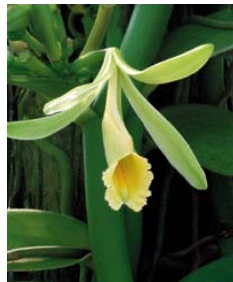
Vanilla planifolia blooms are only open for one day and outside of Mexico need to be hand-pollinated to produce the Vanilla pod or bean.

He is a horticultural consultant and certified arborist. He is the Recipient of over 20 AOS flower awards including the Herb Hager Award for most outstanding phalaenopsis awarded in 1992. He still surfs at any opportunity!!