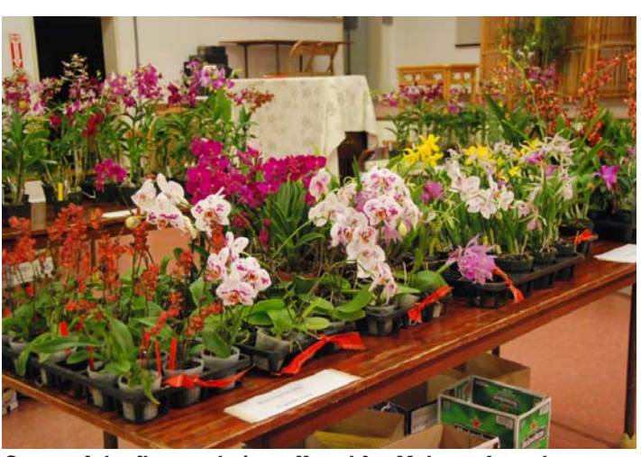
Some of the flowers being offered for Makana Awards.

The GIOS members again lived up to their reputation for being good cooks. There was such a wonderful variety of foods: Japanese, Filipino, Indonesian and traditional American foods were all well represented and they reflected the makeup of the club.