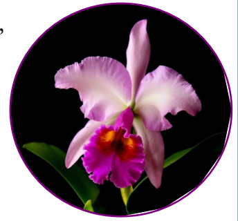
C. Claesiana