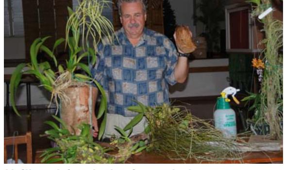
Neill explains the basics and why coconut husks are a better choice when mounting vandas.