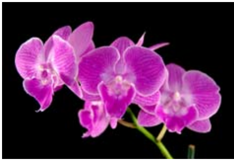
Best Lavendar Phalaeonopsis - Phal.Yolande Yoseta Wever x Phal. World Class 'Big Foot' – Grower Al Sugano