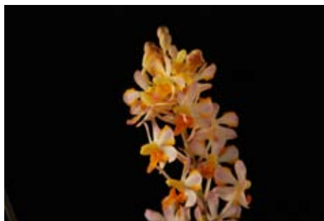
Best Misc. Vanda - Ascovandoritis Prapin – Grower Orchid Alley