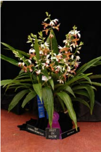
Best in Show/Best Flowering Specimen/Best Genera - Phaius Wild Thing – Grower Judy Matsumoto