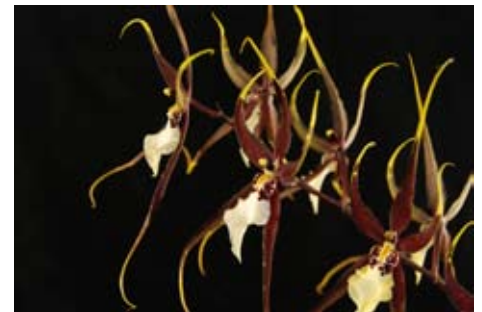
Best Brassia: Mtssa. Kauai Choice 'Tropical Fragrance' AM/AOS – Gwen Teragawa