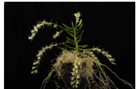
Best Angraecum - Oenoniella polystachys – Grower Allen Yamada