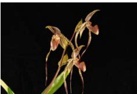
Best Paphiopedilum: Paph. Lady Booth #3' x Prince Edward of York – Grower Orchid Alley