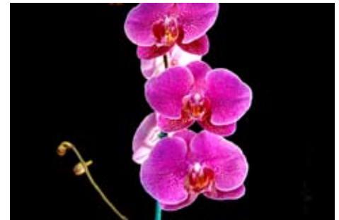
Best Other Color Phalaeonopsis - Dtps. Bread Ham – Grower Allen Yamada