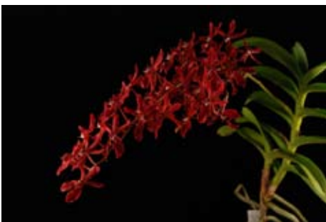
Best Renanthera - Renanthera Azimeth – Grower Orchid Alley