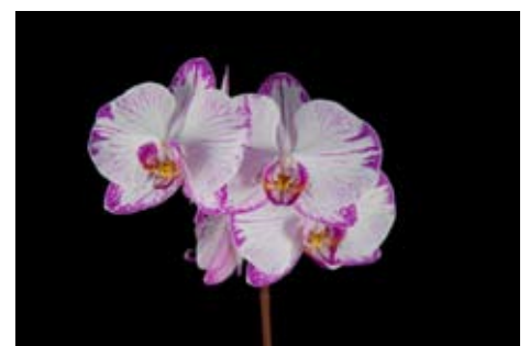
Best Pink Phalaenopsis: Dtps. Minho's Princess – Grower Al Sugano