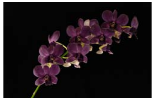
Best Blue Dendrobium: Den. Sakda Blue – Grower Al Sugano