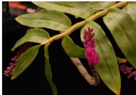
Best Species/Lavender Dendrobium: Den. Secundum – Grower Orchid Alley