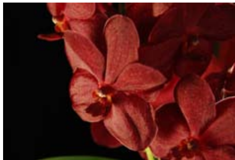
Best Vanda Alliance - Ascocenda Ascda. Fuch's Port Royal x Yip Sum Wah – Grower Orchid Alley