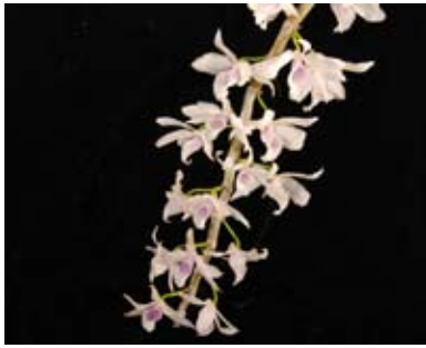
Best Honohono: Neifert's Superscent – Grower Gwen Teragawa