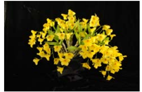
Best Yellow Dendrobium: Golden Aya – Grower Orchid Alley