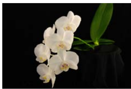
Best White Phalaenopsis: Phal. Amabillis (#1) x Amabillis – Grower Al Sugano