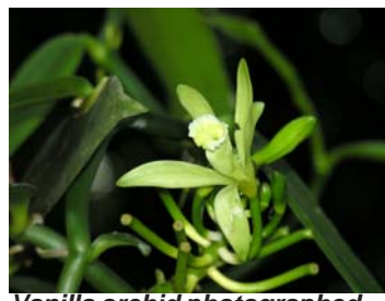
Vanilla orchid photographed in Costa Rica by Ada Koene.

from the freezer and bring them to room temperature. Slowly bake the pods in an over at a temperature of 113 - 131 degrees until they become pliable. The pods can be stored in a light proof box for about two months so the aroma can develop fully."