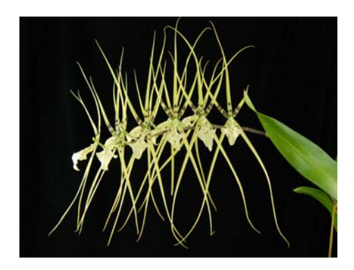
Best Brassia: Br. Rex 'Christine' – Owner Orchid Alley