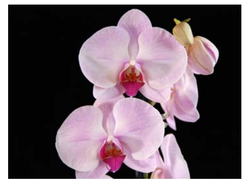
Best Pink Phalaenopsis: Dtps. Akebono X Dtps. Hsinying Mount – Owner Amy Sugano