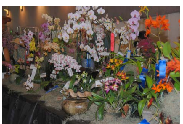
Left: an overview of one of the displays.

Many mahalos to all who helped make this a big success.