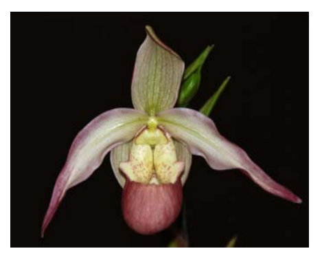
Best Phragmipedium: Phragmipedium Calurum – Neill Sams