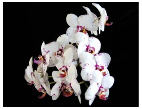
Best Other Color Phalaenopsis: Phal. Brother Pico Hunter X Hwafeng Redfire – Owner Hanalei orchids