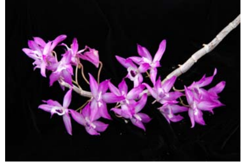
HC/AOS, Best Nobile Dendrobium: Den. Super Ise x Den. Super Nestor – Owner Hanalei orchids