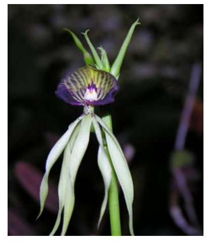
Best Species: Epi. Cochleatum – Owner Hanalei Orchids