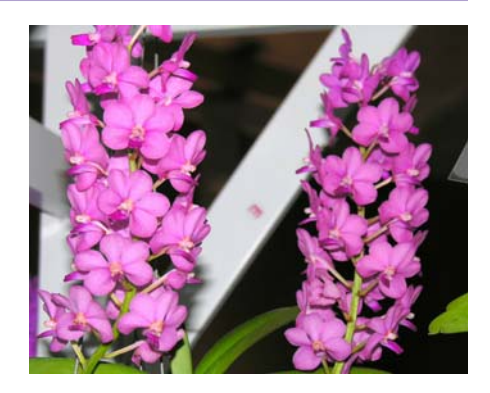
Best Rhyncastylis: Vascostylius Pine Rivers – Orchid Alley