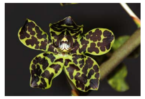
Best Grammatophyllum: Gram. Tiger Paw – Own Hanalei orchids