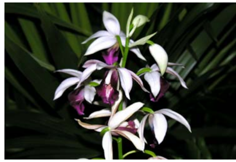
Best Other Genera: Phaius Bebe Chien 'Kalaa' – Orchid Alley