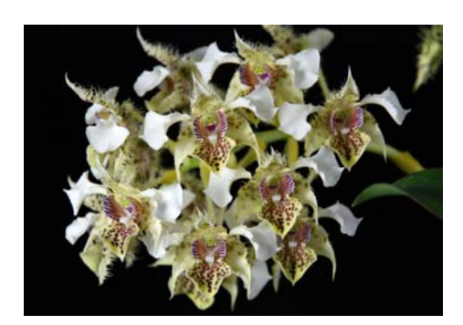
AM/AOS, Best Other Color Dendrobium: Den. Polysema x Den. Eximum - Owner Hanalei Orchids