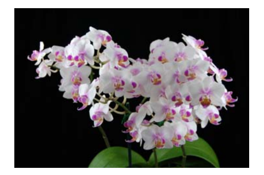
Best Flowering Specimen: Dtps. Neifert's Flower Cloud var. Hanalei CCM/HOS – Owner Hanalei Orchids