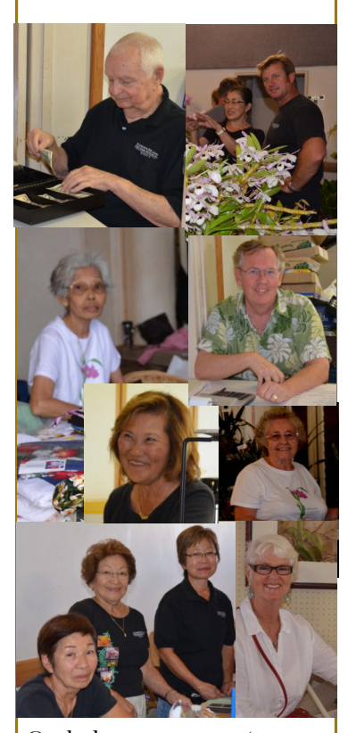
Orchid quiz answers (no cheating) for matching in order of pictures: 4f, 1b, 3c, 6e, 5d, and 2a.

Tags were missing from our door prizes from February. The plant name is Aztec Nalo (Miltonia).