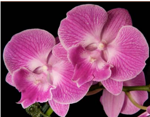
Best Phalaenopsis Pink: P. Big foot; Owner Al Sugano