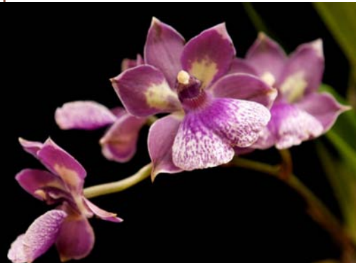
Best Zygopetalum: Zygo Rogue Brune 'Little Purple Eye'; Owner Orchid Alley