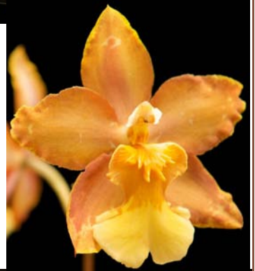
Best Odontoglossum : Wils. Hilda Plumtree 'Purple Wing' ; Owner Gwen Teragawa (below)