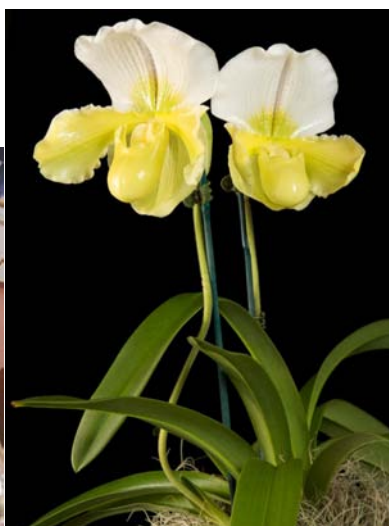
Best Paphiopedilum: Paph. In charm Greenery 'In Charm'; Owner Al Sugano (left)

Below visitors checking out the fine orchid crafts before entering the show.