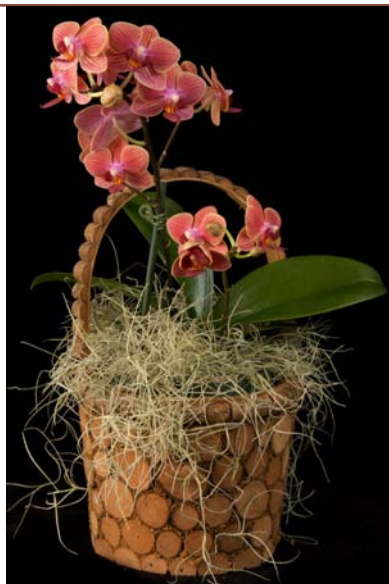
Best Phalaenopsis Red: P. (Sunrise Delight x Super Pixie); Owner Al Sugano