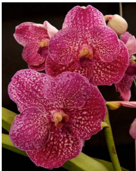
Best Vanda Red: V. Thongkai x V Chamanaud; Owner Orchid Alley