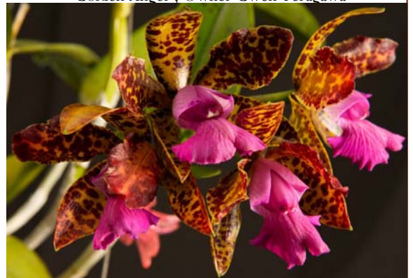
Best Other Color Cattleya: Cattleya Landate ; Owner Orchid Alley