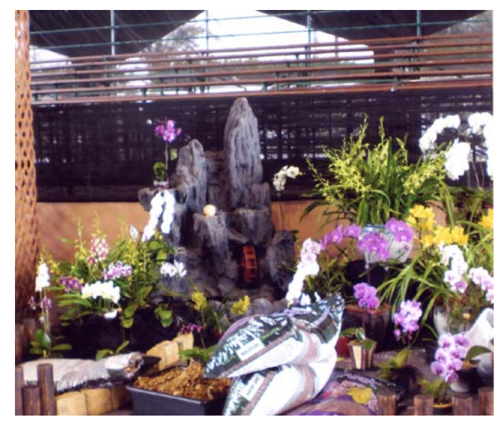
Hilo Orchid Show.