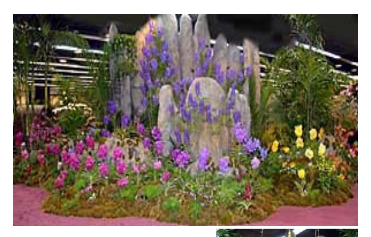
Above and right: 'On the Road to Mandalay", Grand Champion exhibit and Golder Medal Winner, R.F. Orchids