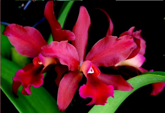
Laelia + Brassavola + Sophronitis + Cattleya = Potinara Pot. Netsiri Star Bright (to the left)