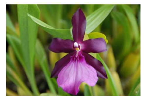
Best Miltonia: Milt. Neifert's Gem – Owner Hanalei Orchids