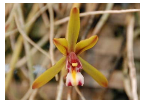
Best Cymbidium: Cym. findlaysonianum – Owner Orchid Alley