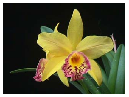
Blc Haiku Dawn 'Sunshine and Raspberries'