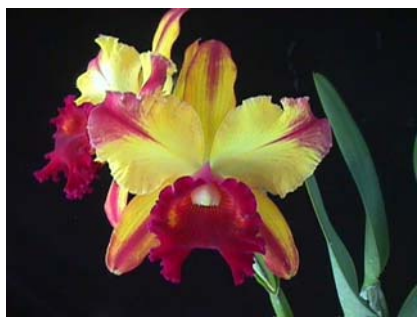
Blc Toshie Aoki 'Pizazz'