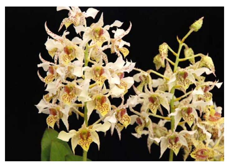
AM/AOS Den. Aussie Sweetness – Owner Hanalei Orchids