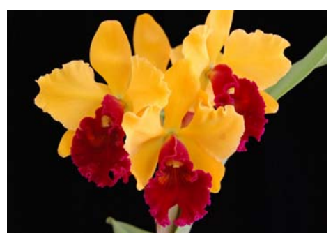
Best Other Color Cattleya: Blc. Gladys Oumae x Blc. Toshie Aoki – Owner Hanalei Orchids