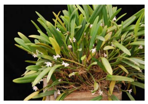
Best Miniature: Cadetia taylori – Owner Orchid Alley