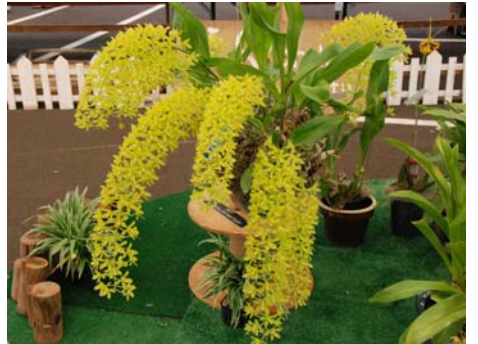
Best Flowering Specimen and Best Grammatophyllum: Gram. scriptum 'Hanalei' CCM/AOS – Owner Hanalei Orchids