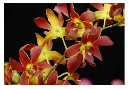
Best Other Color Dendrobium: Den. Neifert's Choice – Owner Hanalei Orchids