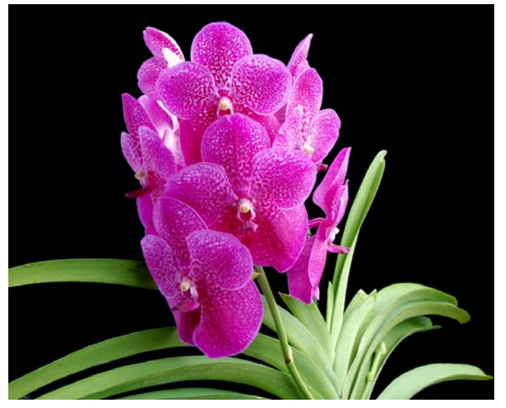
AM/AOS/ Best in Show: V. Fuch's Delight 'Hawaii Special' - Owner Orchid Alley