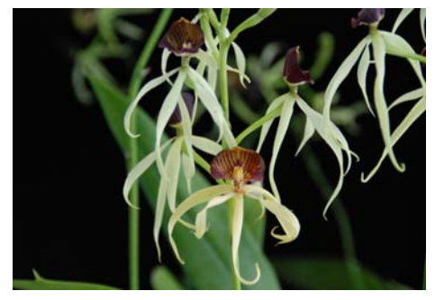
Best Epidendrum: Epi. cochleate – Owner Hanalei Orchids