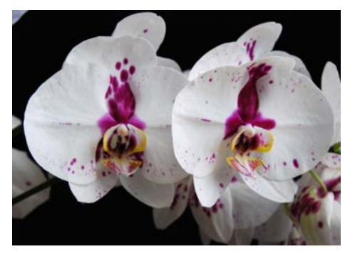
Best White Phalaenopsis: Phal Hsinying Sparkle x Hsinying Crane – Owner Hanalei Orchid