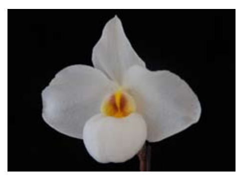
Paphiopedilum Single Flower Other Color: 1st Place: Paph. Armeni White – Owner Al Sugano