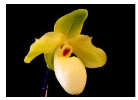
Paphiopedilum Single Flower Yellow 1st Place: Paph. Pinocchio 'Hsinying' x armeniacum — Owner Allen Yamada