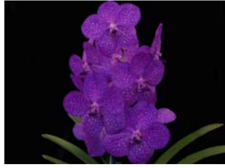
Vanda Alliance: Ascocenda: 1st Place: Ascda. Mikasa 'Sapphire' AM/ AOS – Owner Orchid Alley