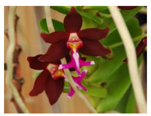
Trichoglottis: 1st. Place: Trichoglottis brachiata – Owner Orchid Alley