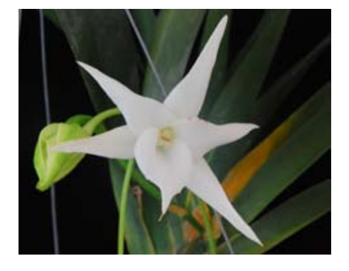
Left: Best Angraecum Angraecum Lemford White Beauty - Owner Orchid Alley