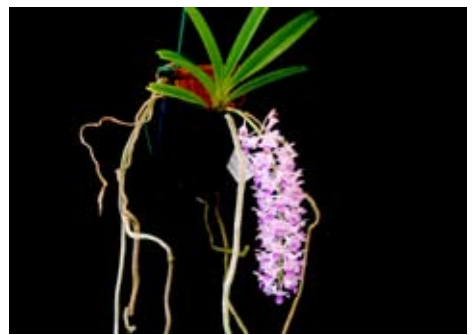
Species: 1st Place: Rhynchostylis retusa – Owner Orchid Alley