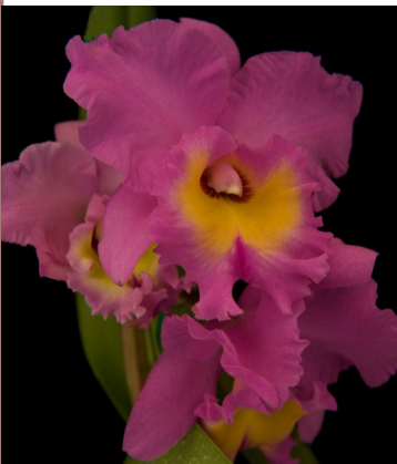
Lavender Cattleya Bc Norman's Bay 'Hercules' x Bc Spring Dawn 'Top Row' ; Owner Orchid Alley