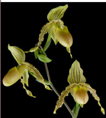
Best Paphiopedilum—Paph. Deena Nichole x Paph. Primulinum 'best' ; Owner Orchid Alley