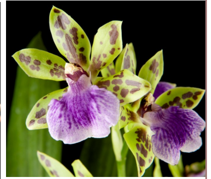
Best Zygopetalum-Zygo Adelaide Meadows ‘Brabus’ x Ptpm Matilda ‘Elizabeth’; Owner Orchid Alley