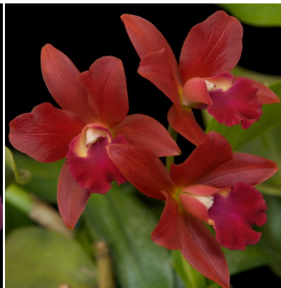
Red & Orange Cattleya C. Chocolate Drop ; owner Orchid Alley