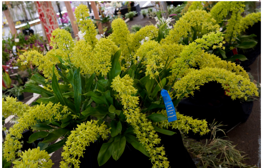
Best Flowering Specimen and Best Grammatophyllum—Gram. Scriptum citrinum (hihimanu) ; Owner DeeDee Gorospe