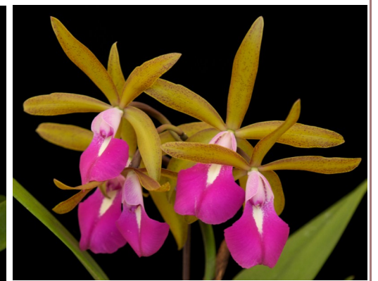
Best Other Color Cattleya—Iwanaga Bc. Star Ruby 'Kirshi' Am x C. bicolor #s Owner Orchid Alley