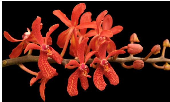
Best Renanthera; Hawaiian Red Velvet ‘Atreides’; Owner Orchid Alley