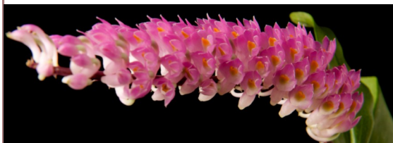
Best Miniature Den. secundum; Owner Orchid Alley