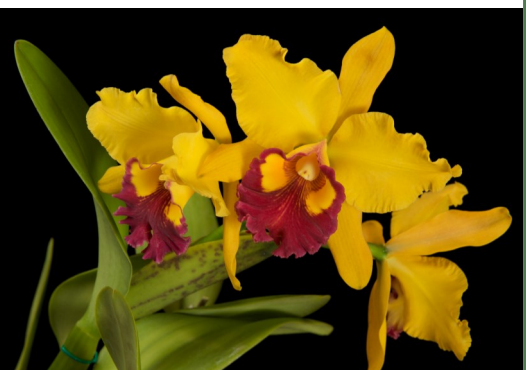
Orchid Alley's BLC. COLOR MAGIC 'MENDENHALL' was awarded Cattleya Yellow 1st place.