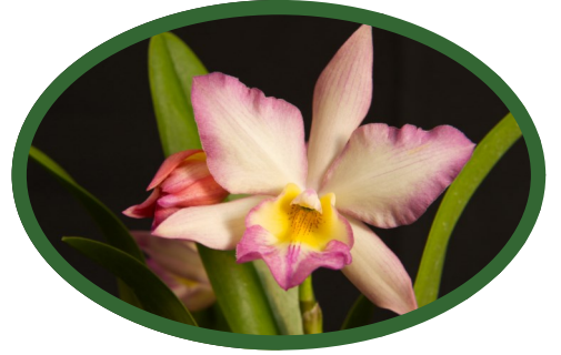
Iwan. Apple Blossom