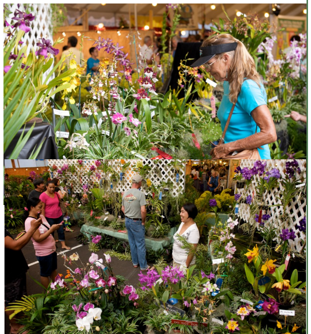
Right: fair attendees admiring the display and getting lots of pictures.