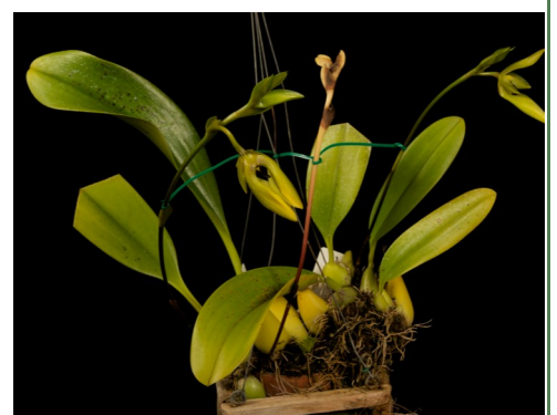
Orchid Alley's BULBOPHYLLUM CARUNCULATAM was awarded Best Bulbophyllum.