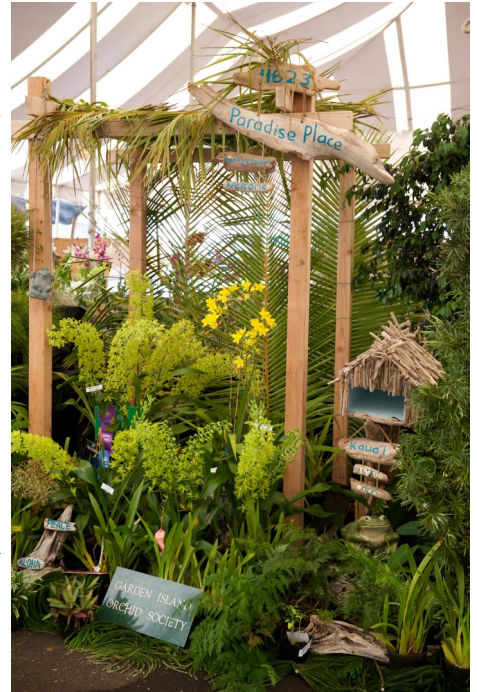
Entrance to the Orchids in Paradise Show at the Farm Fair.