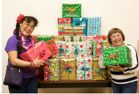
Table full of gifts donated in 2017

Again this year, GIOS will be donating gift wrapped presents to the United Church of Christ, who will hand these out to folks in need at the church's community luncheon held later in December. This is our opportunity to give back to our community by helping the less fortunate and support the Church of Christ that so generously allows us the use of their facility.