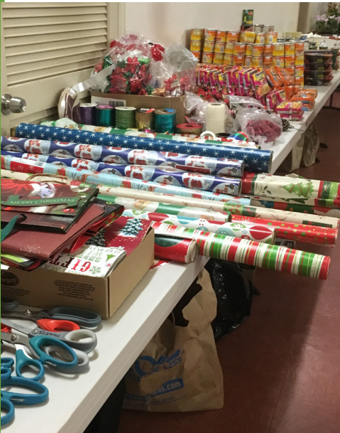
A table full of beautiful gift wrapping materials and accessories

One of the most important parts of the evening was the opportunity to give back to our community and our neighbors in need by wrapping Christmas presents filled with food, and donating the packages for distribution by the Hanapepe United Church of Christ. Thanks to all of our members who graciously donated their food and time. The following photos capture our generous members preparing and wrapping the donated gifts.