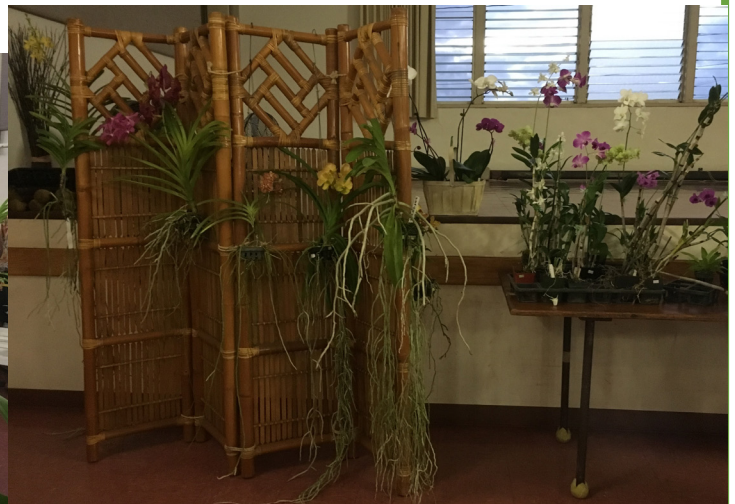
A sampling of the many wonderful orchids (upper left and above) and handy gardening supplies (lower left) available for purchase with Makana Points this year