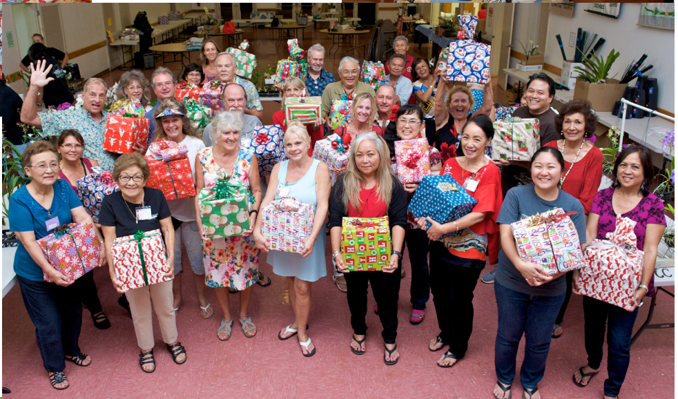
GIOS members celebrating the end to another successful year and proudly showing all of the wrapped gifts being donated to the United Church of Christ