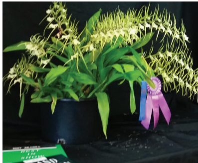
2018 Spring Fantasy Show Grand Champion Brassia Rax "Sakata" AM/AOS owned by Pearl Wollin

The show is open to the public and anyone interested is encouraged to attend.