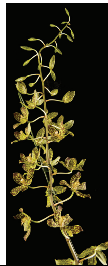
Grammatophyllum Gram Fely's Sunshine owned by Orchid Alley