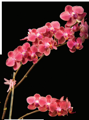
Phalaenopsis Red Phalaenopsis owned by Mildred Yamauchi