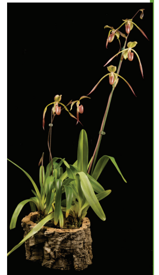
Paphiopedilum Paph Lady Isabel '#2' x Paph Lowii 'Bear' BM/ TPS owned by Orchid Alley