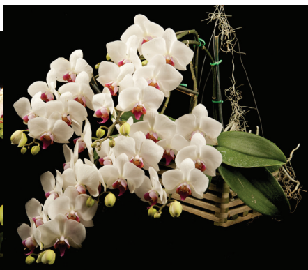
Phalaenopsis White Phalaenopsis owned by Paul Brun