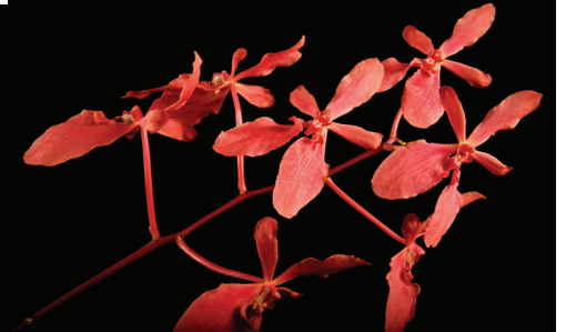
Renanthera Ren Kasem Jumbo 'NN' owned by Orchid Alley