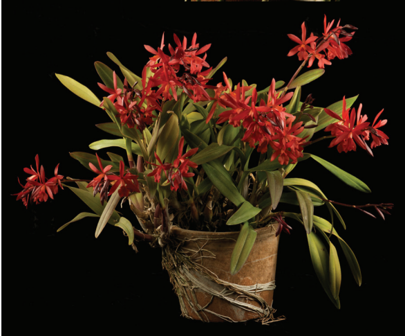
Best Flowering Specimen

Neostylis Lou Sneary 'Bluebird' owned by Pearl Wollin