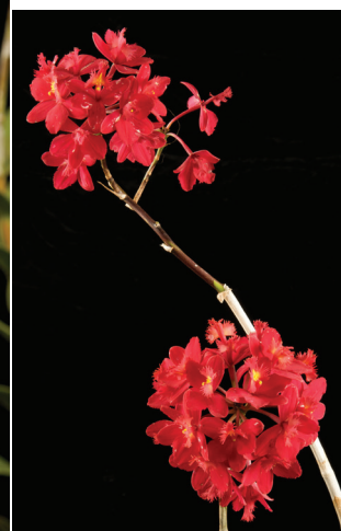
Epidendrum Red Epidendrum owned by Mildred Yamauchi