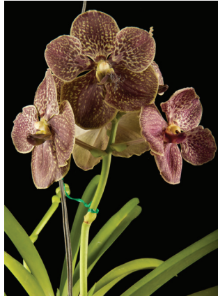
Vanda Other Color

Vanda Esther Araneta owned by Orchid Alley