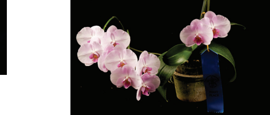
Phalaenopsis Pink Phalaenopsis owned by Greg Iten