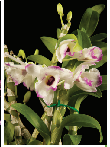
Dendrobium Nobile White Den Love Memory 'Fizz' owned by Orchid Alley