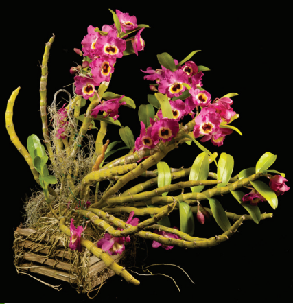
Dendrobium Nobile Purple Den Nobile Red Emperor owned by Mildred Yamauchi