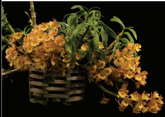
Dendrobium Nobile Yellow Den Nobile owned by Paul Brun