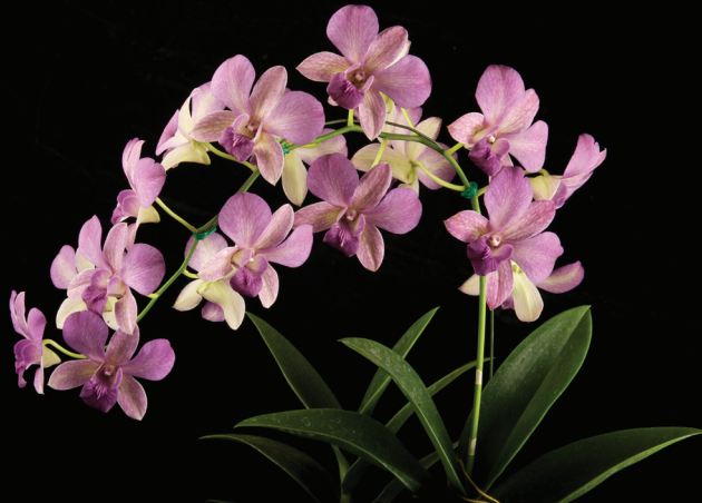
Dendrobium Blue Den Blue Charm x Burana Dark Blue owned by Nancy Nakama