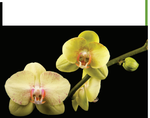
Phalaenopsis Yellow Phal Golden Sands x Phal Masahino owned by Al & Amy Sugano