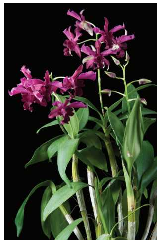
Dendrobium Red D Violet Yamaji 'Puanani' owned by Orchid Alley