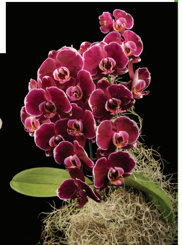
Phalaenopsis Other DTPS 5051 owned by Orchid Alley