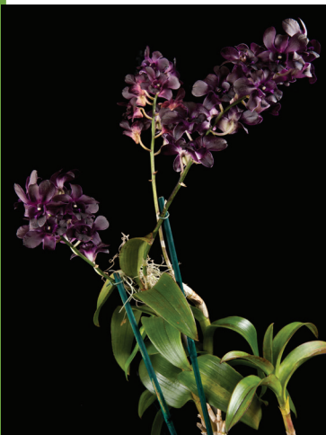
Dendrobium Black Den Negro owned by Al & Amy Sugano