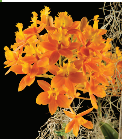
Epidendrum Orange Epi No Name owned by Amy & Al Sugano