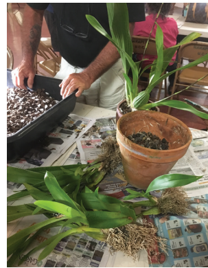
A large orchid being divided and the smaller sections re-potted