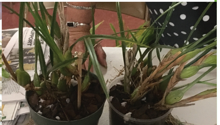
Loose branches of a coconut orchid (maxillariella tenuifolia) (left), now happy in their new pots and medium (right)