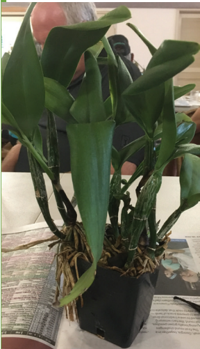
An orchid in need of re-potting judging by the roots overhanging the pot