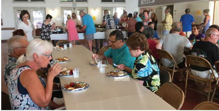
Hungry members enjoying some tasty dishes

The potluck featured a smorgasbord of incredible dishes with a wide variety that satisfied every appetite.