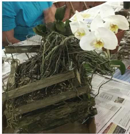
Another orchid needing attention, this one outgrowing its wooden container