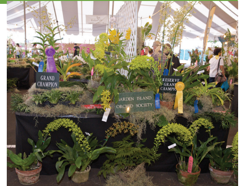
View of our 2018 Orchids In Paradise display with awards presented

At our upcoming meeting we will be discussing this fall's Orchids in Paradise Show at the Kauai Farm Bureau Fair and will be conducting volunteer sign ups during the refreshment break. Our Society's orchid display, along with the bonsai and anthurium clubs' displays, are always a big draw and a highlight of the Fair for many attendees. Since I first joined GIOS I've constantly been amazed at all the hard work our members do to make sure we have a successful show. The Fair is an excellent opportunity for members to display and share their blooming orchids to a large audience, as well as to encourage others to get involved in growing orchids.