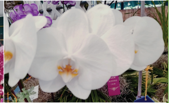
Phalaenopsis Spots & Stripes P. chian xen magnie x P formosa rose owned by Orchid Alley