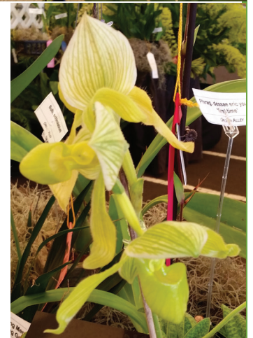
Paphiopedilum Paph summer isles 'green bird' x philippinense var. album owned by Orchid Alley