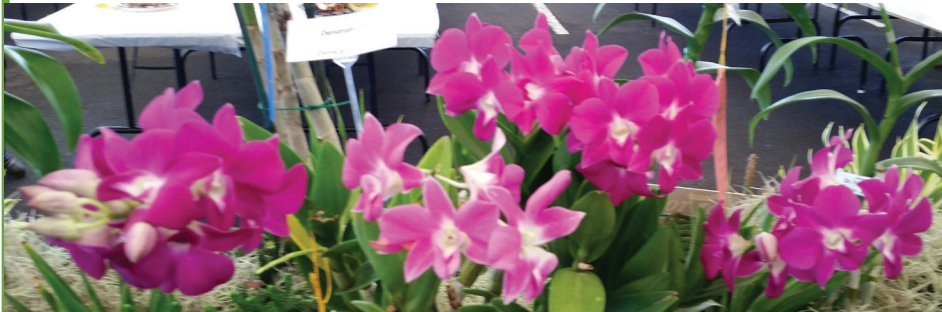
Dendrobium Lavender Dendrobium owned by Caryn Sakahashi