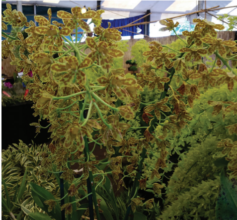
Grammatophyllum Grammatophyllum Measuresianum owned by Paul Brun