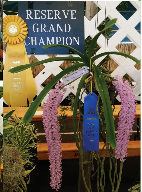
Orchids in Paradise Show Reserve Grand Champion Rhynchostylis Perusa owned by Teri Nakamoto