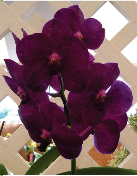
Vanda Blue ASCDA Adisika Blue owned by Orchid Alley