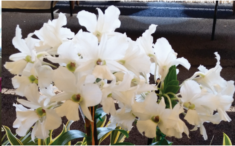
Dendrobium Latouria Den sanderae var luzonicum x sib owned by Orchid Alley