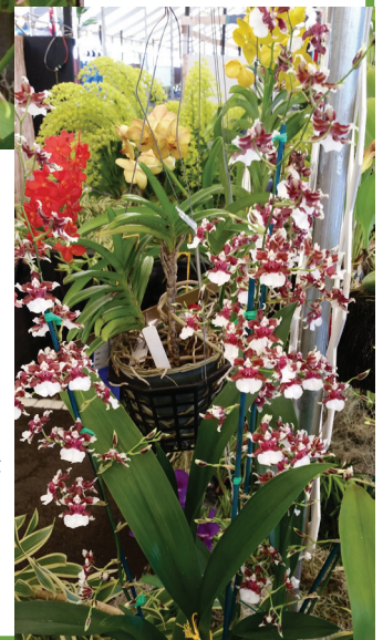
Oncidium Oncidium Heaven Scent owned by Al Sugano