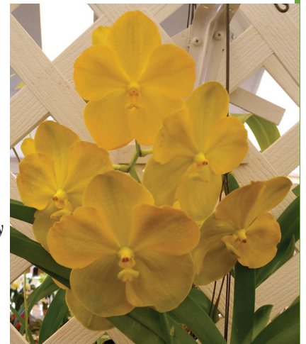
Vanda Yellow Vanda dongchai pusavat owned by Orchid Alley