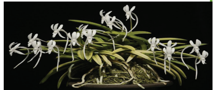
Neofinetia Falcata - Not Just Another Pretty Face, learn more at http://www.aos.org/blog/orchids-issues/neofinetia-falcata.aspx