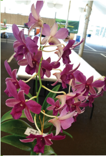
Dendrobium Blue Den Blue Charm x Burana Dark Blue owned by Nancy Nakama