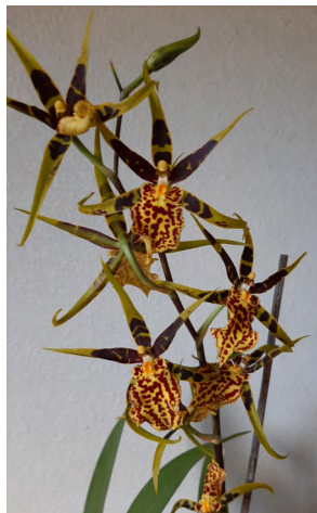
BDC Gilded Tower 'Mystic Maze'