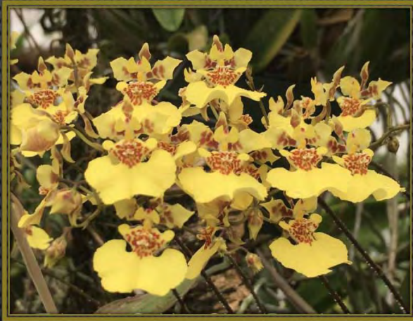
Tolu Golden Glow 'Brenda Aday'