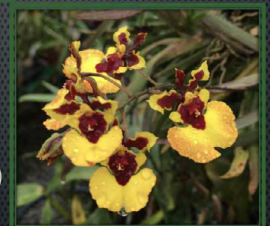
Tolu Genting Orange 'Cora' (Name not registered)