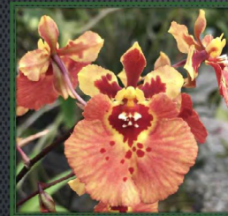
Rrm Harvest Moon 'Christino Olivas'