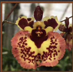
Rrm Volcano Flare 'Carolina Olivas Afaop'