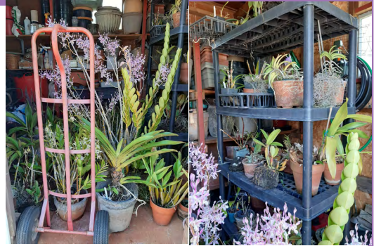
Above, small shed filled with orchids

Well it has been an interesting couple of weeks. I, like many of you, have a lot of orchids in my yard and in a small shade house. With Douglas heading straight for the islands, I started cleaning up my yard and moving all my orchids and other plants into a small shed and in my garage. I also moved a lot of the miscellaneous outdoor things like lounge chairs, umbrellas, bar be que, etc first. The spots where I was placing my orchids prohibited watering so I waited, and then it was a rushed two days. Hard work, but if Douglas hit, I did not want to lose all my plants.