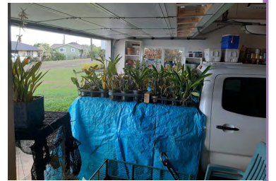
The garage and truck make excellent storage locations!

It wasn't until the night before it was predicted to hit did we learn that it was only going to skim the islands. Such a relief as the impact of the wind and flooding here on Kauai would have been huge. 2020 has been difficult enough without a hurricane. The next morning I thought, "dang, now I have to put it all back together."