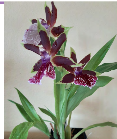
Galeopetalum Arlene Armour 'Conching'