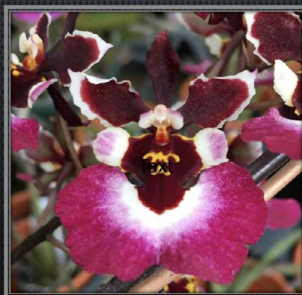
Tolu Jiaho Rose 'Fantasy Rose' AM AOS