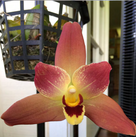
Stanhopea insignis 'dark jungle x self'