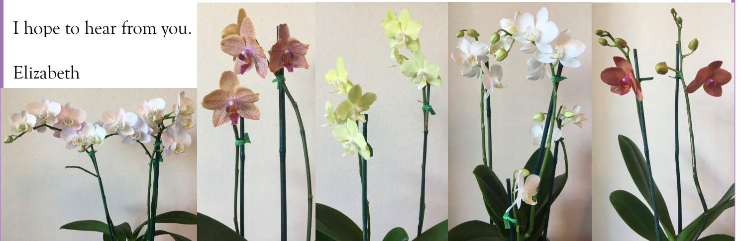
Orchids on this page