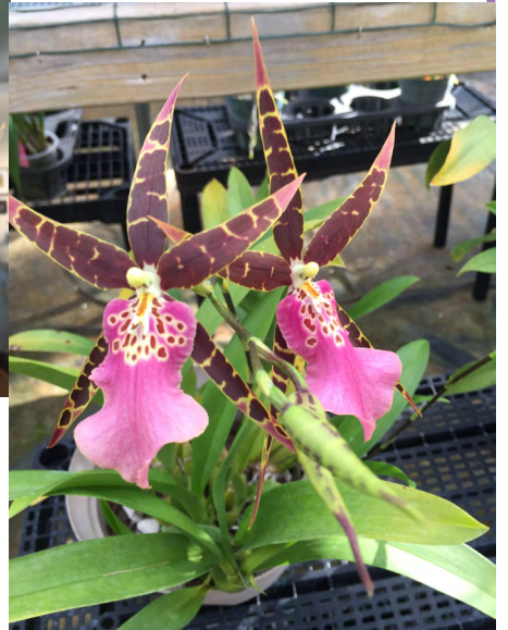
Miltassia Shelob 'Tolkien'