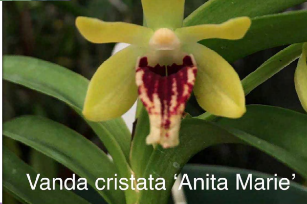
Vanda cristata 'Anita Marie'