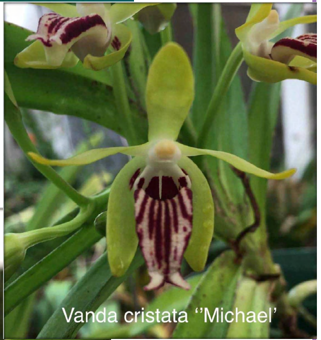
Vanda cristata 'Michael'