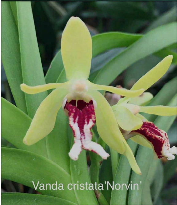
Vanda cristata 'Norvin'