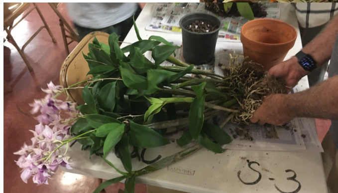
A beautiful flowering orchid being separated