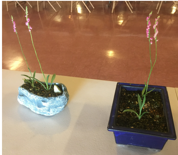
Some orchids from the member display table. These tiny spiral orchids were quite amazing and delicate.