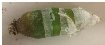
Catasetum bulb with old roots removed ready for rooting

In general, it is time to re-pot when there is new growth coming out of the pot or the roots are overflowing the sides of the pots. Its also best to re-pot when new shoots are coming up at the edge of the pot. Re-pot anticipating the plant's growth. In re-potting, focus on encouraging root growth. When re-potting, put the root mass in the bottom of the pot and put the media on top of the roots to minimize occurrence of root rot.