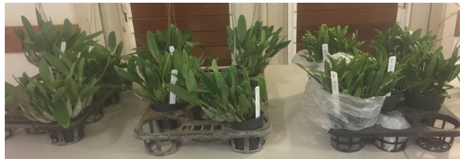
Orchids for sale from Nancy