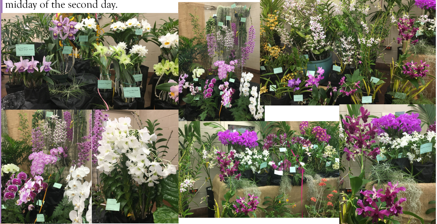
Photos of orchids on display