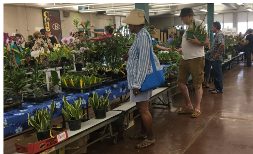
A large selection of plants and supplies from many vendors

A WOS Board member said the show exceeded expectations.