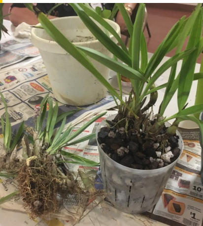
Smaller sections happily re-potted