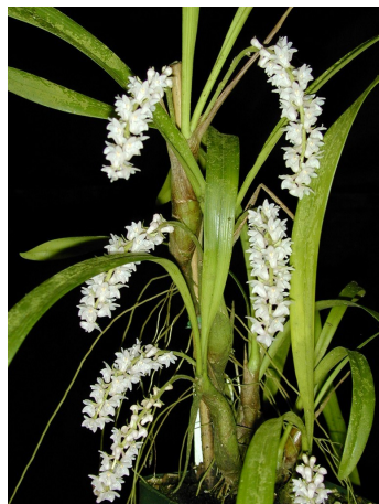
Here is what it looks like in bloom