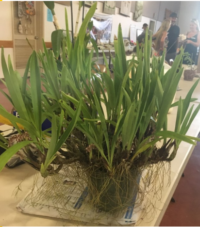
Look what Kimberly brought in!

The October General Meeting's main activity was a re-potting session. Some members brought quite a few plants in need of re-potting. There was lots of help and advice available and everyone walked away with happier orchids in fresh medium and sometimes larger pots.