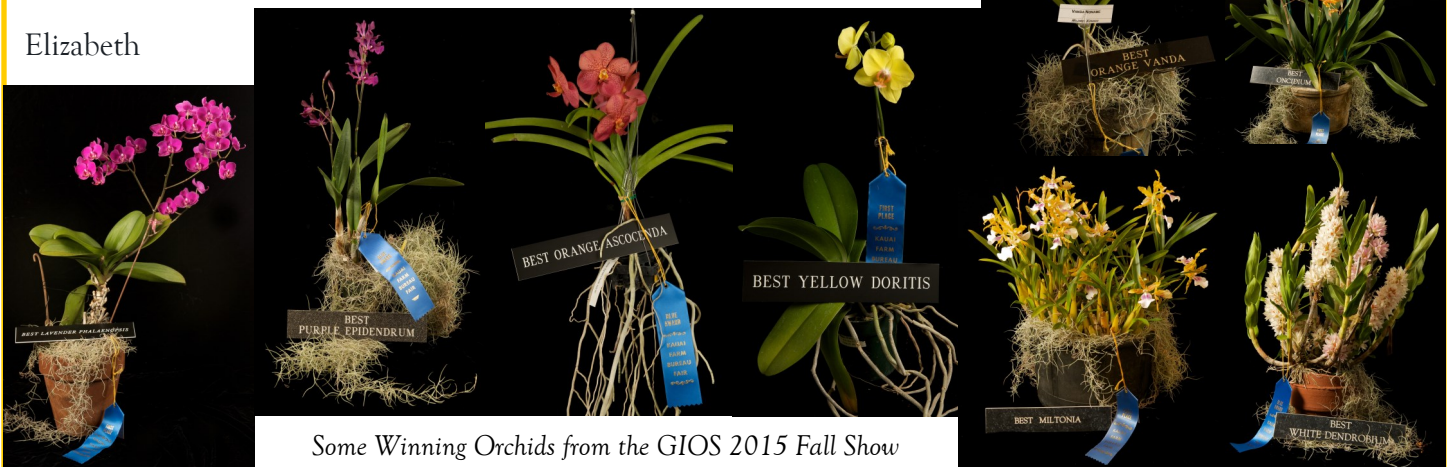
Some Winning Orchids from the GIOS 2015 Fall Show