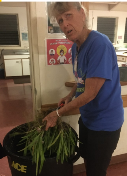
Splitting the beast ....