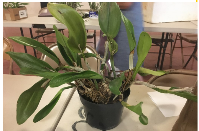
Another overgrown orchid in need of re-potting