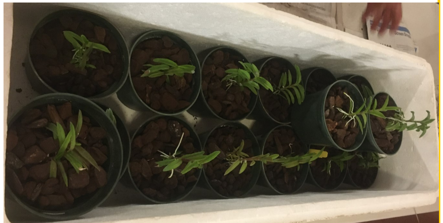
That was a lot of work!!